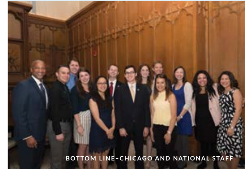
BOTTOM LINE-CHICAGO AND NATIONAL STAFF