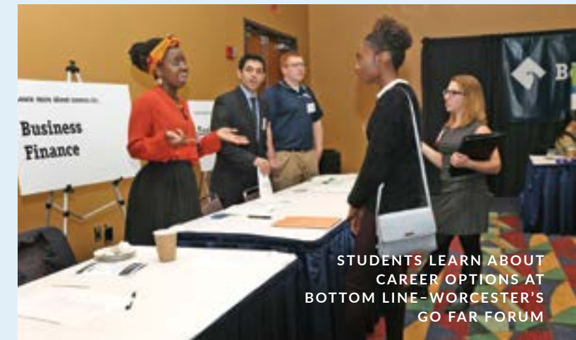
STUDENTS LEARN ABOUT CAREER OPTIONS AT BOTTOM LINE–WORCESTER'S GO FAR FORUM