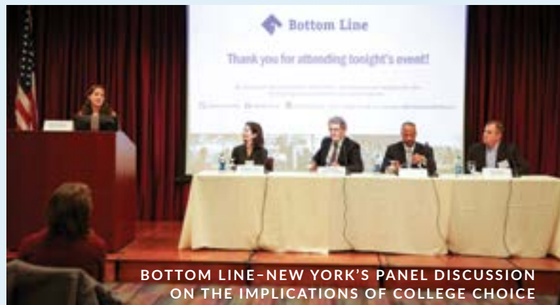
BOTTOM LINE–NEW YORK'S PANEL DISCUSSION ON THE IMPLICATIONS OF COLLEGE CHOICE